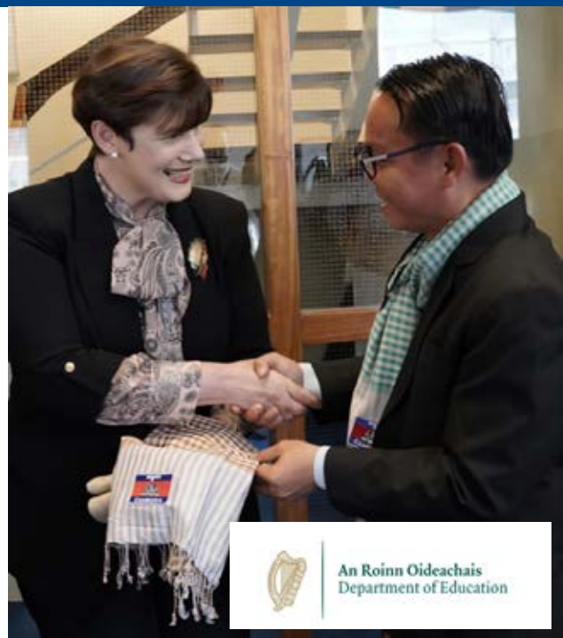
Governor of Kralanh District, Siem Reap Province, Naret Sok, with Minister for Education, Norma Foley.

A key focus of SBB is to enable system change in Cambodia through government partnerships. The group were therefore pleased to have meetings with the Minister of Education Norma Foley and the Minister for Children, Equality, Disability, Integration and Youth Roderic O’Gorman. Matters discussed included education for social change, why quality matters in international development and how Cambodia and Ireland can better collaborate.